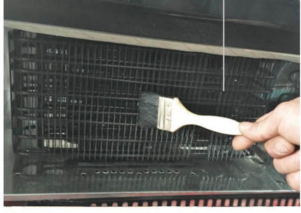
① Use soft brush to sweep